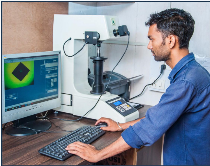
Digital Metallic Vickers Hardness Tester